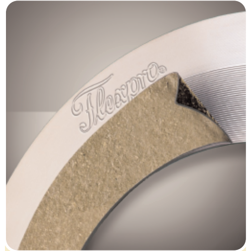
CRITICAL SERVICE SERIES Thermiculite® 845, high temperature facing for Flexpro (Kammprofile) gaskets.